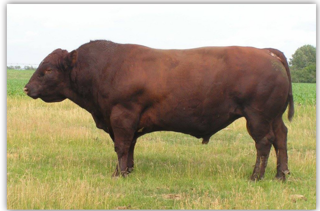
Saskvalley Youngblood 93Y