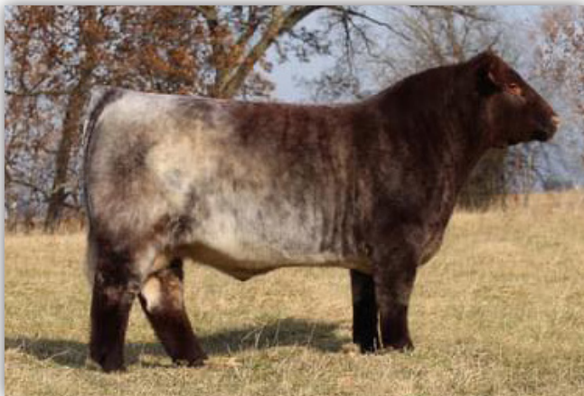
Millbrook Fireball 23F