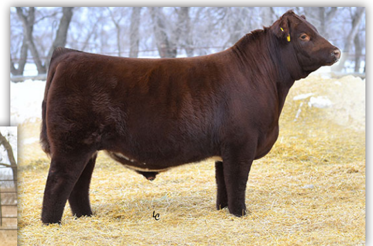
JSF Foreplay 168J

All semen Canadian qualified and Bond & Palermo stored at EastGen, Foreplay stored at AltaGenetics.