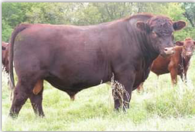
Saskvalley Imagine 65X