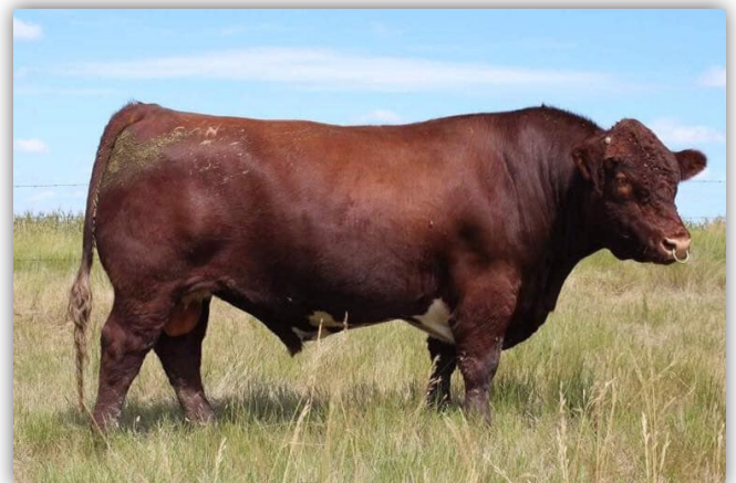
Muridale Jaxson 4A