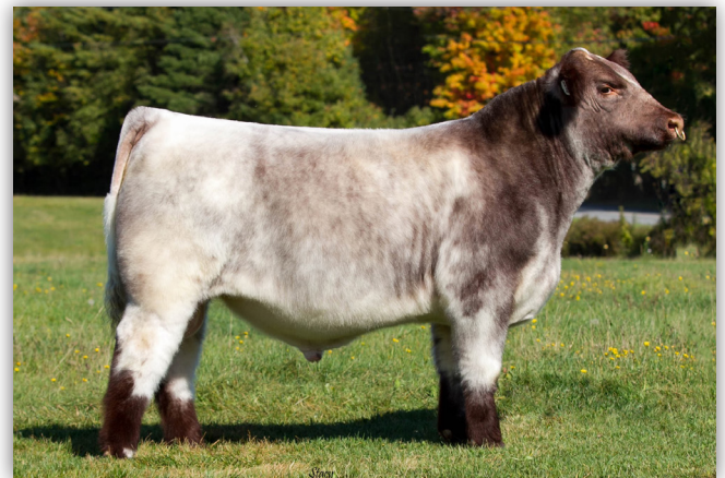
Millbrook Tribute FB 6023J

Choice of three conventional straws on Fireball or Tribute. Stored at Bow Valley & EastGen. Canadian Only.