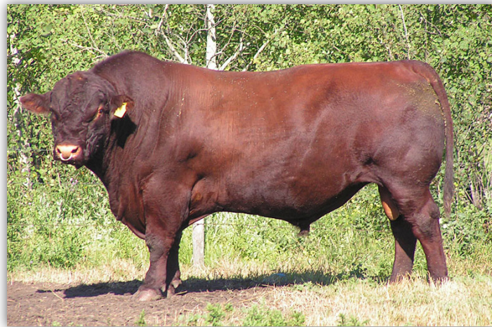
Saskvalley Ramrod 155R