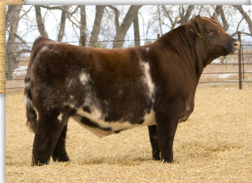
JSF Palermo 172H ET