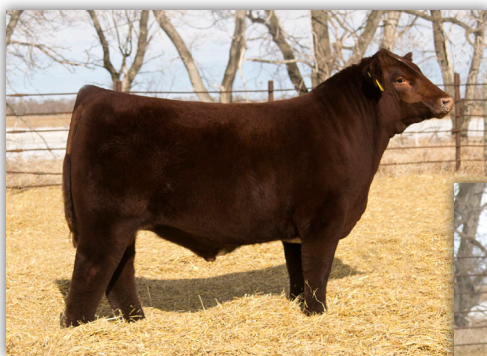
JSF Bond 116H