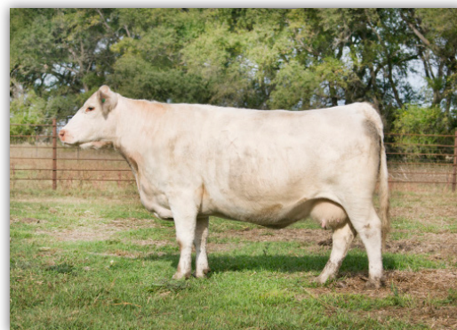
ND ORANGE BLOSSOM 26X3